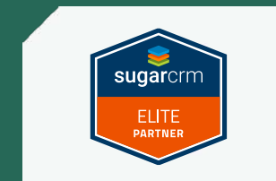
One of the world's most awarded SugarCRM partners